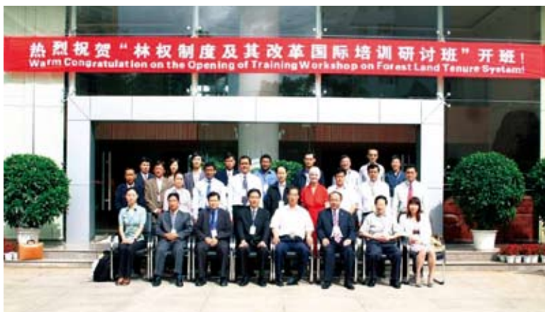
Group photo of workshop participants

The 12-day workshop aimed to improve forest development and community forestry in Asia-Pacific countries by identifying the key challenges they face with regard to forestland tenure reform and by proposing possible solutions. Fourteen senior forestry officials attended from 12 countries. Course modules combined