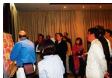
Discussions in the workshop