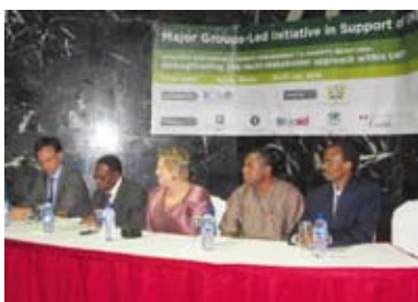
Invitees at the opening ceremony

With an aim to support the 9th session of the UNFF and the International Year of Forests in 2011, a major group-led initiative forest workshop, entitled “Applying Sustainable Forest Management to Poverty Reduction” was held from 26-30 July, 2010 in Accra, Ghana. APFNet sent a representative and also financially supported the participation of a professor from Renmin University who is an expert on traditional knowledge. Focusing on forest and people in Asia-Pacific, APFNet will consider drawing on the outcomes of the workshop in its plan for 2011 to celebrate IYF.