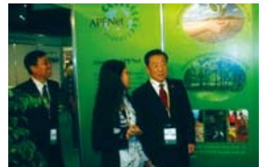
Mr. Jia Zhibang, Minister of the State Forestry Administration of China, visited APFNet's booth

The booth attracted many visitors who viewed a promotional video and eye-catching posters. During the exhibition, APFNet staff distributed flyers and souvenirs, as well as informed guests of its establishment and activities. Staff also visited booths of other international/regional organizations and institutions, exploring their interest in collaborating to promote sustainable forest management in the Asia-Pacific region.