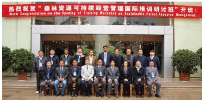
Group photo of the workshop participants