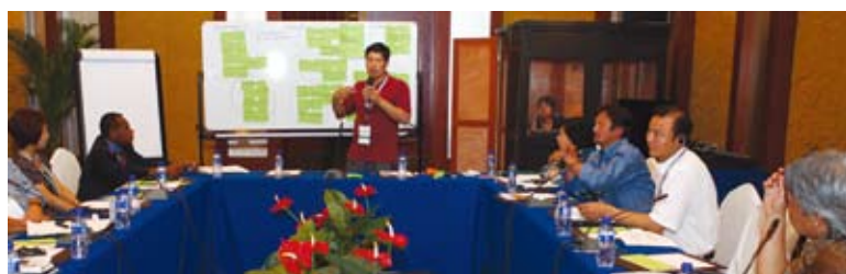
Discussion in Group C