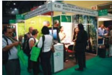
APFNet booth is popular among WFC participants

APFNet set up a booth at the exhibition site of the XIII World Forestry Congress which took place from October 18 to 23, 2009 in Argentina. This gathering of forestry practitioners every six years brought together almost 7000 participants.