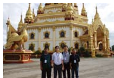
Participants enjoying the field trip