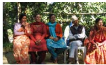
APFNet staff in talk with local people

As the name suggests, "Demonstration of Sustainable Forest Management with Community Participation in Nepal" aims to promote participatory sustainable forest management to improve the livelihood of forest dependent poor people. The 3-year project will be launched in the second half of this year.