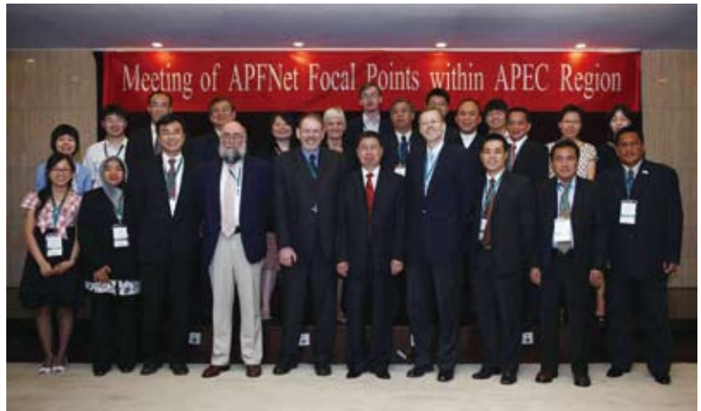
Group photo of the participants and the APFNet Secretariat

So far, 16 APEC and 10 non-APEC economies have named focal points and more are expected to become involved.