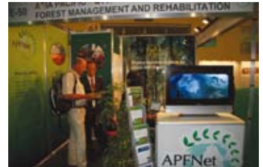
APFNet staff presenting publicity materials to a booth visitor

The booth attracted many visitors who viewed a promotional video and eye-catching posters. During the exhibition, APFNet staff distributed flyers and souvenirs, as well as informed guests of its establishment and activities. Staff also visited booths of other international/regional organizations and institutions, exploring their interest in collaborating to promote sustainable forest management in the Asia-Pacific region.