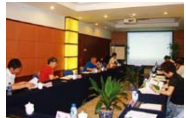
Experts discussing in the seminar

Experts from the UNDP, TNC, WWF, INBAR, PEFC, and CAF, Renmin University of China met to assist APFNet to finalize draft guidelines for appraising project concept notes. Their valuable insights and comments served to improve both the approach and the process.