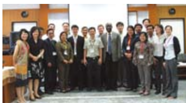
Workshop group photo

This workshop, organized by RECOFTC, FAO and the NFP Facility, is the second of four such meetings to build capacity to deal with conflict. The course was designed to allow participants to engage in ongoing critical reflection, encouraging them to link the information they were given with their own experiences and to tailor conflict management techniques and training methods to their specific circumstances.