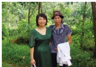
Field visit to APFNet pilot project site

"Demonstration of capacity building for forest restoration and sustainable forest management in Vietnam" was launched in July 2010 to demonstrate how to maximize the contributions of forests in terms of eliminating hunger, alleviating poverty, improving livelihoods and providing environmental services.