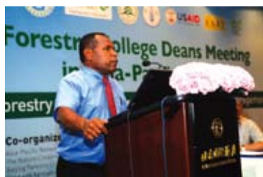
Group rapporteur presenting to the plenary