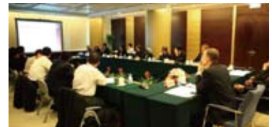
Presentation at the meeting