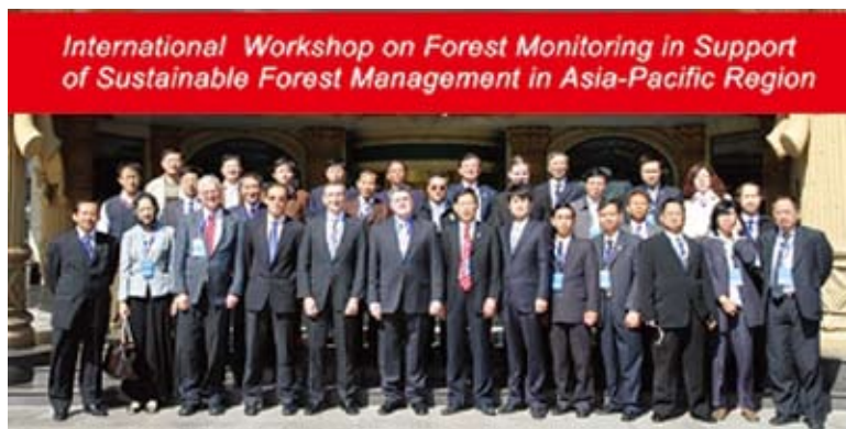
35 officers and experts in the field of forest monitoring attended the workshop

APFNet co-organized and sponsored an international workshop on forest monitoring, in collaboration with the Chinese Academy of Forestry and GOFC-GOLD. Some 35 experts from FAO, GOFC-GOLD and 10 Asia-Pacific countries discussed policies and techniques in terms of actively promoting SFM. They requested APFNet to support follow-up courses to further improve the capacity and the skills for forest monitoring using remote sensing technology.