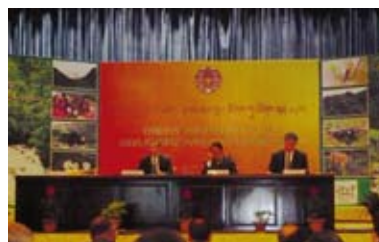
Plenary of the 23 rd Session of APFC

The 23 rd session of APFC was held in Thimphu, Bhutan from June 9 to 11, 2010. It was organized around the theme “Forests—our heritage, our future”; it was attended by 150 participants from 29 member countries and more than 20 international organizations; and presented an exciting array of events and discussions on forest management and forestry in the region. The APFNet representative informed participants in an open forum of the network’s activities and answered questions.