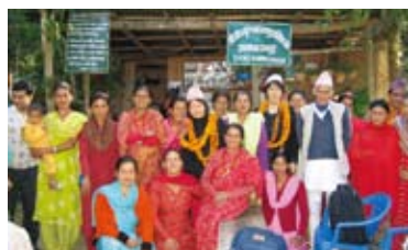
Gender participation in local community

As the name suggests, "Demonstration of Sustainable Forest Management with Community Participation in Nepal" aims to promote participatory sustainable forest management to improve the livelihood of forest dependent poor people. The 3-year project will be launched in the second half of this year.