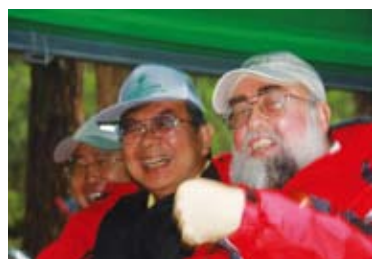
The field trip

The Symposium on Sustainable Forest Management in the Greater Mekong Subregion (GMS), more like a brainstorming session, provided a venue to exchange experiences on forest rehabilitation and sustainable forest management, identify priorities, and explore ways in which APFNet and GMS countries can enhance collaboration on forest issues in the region. 22 representatives from forest agencies, the Mekong River Commission (MRC), TNC/RAFT, Southwest Forestry University (SWFU) and the APFNet Secretariat were in attendance. Country reports on national forest policies and strategic plans for SFM, as well as main challenges were presented. Priority activities at both national and regional levels were proposed for future cooperation with APFNet.