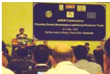
The plenary of the ASEM conference

Entitled “Forests, Forest Governance and Forest Products Trade: Scenarios and Challenges for Europe and Asia”, this conference brought together policy-makers, academics and representatives of civil society and the private sector to build synergies with other regional processes and programs such as FLEGT, ASEAN forestry initiatives, AFP, and East Asia FLEG process. It took place in Phnom Penh, Cambodia, May 4-5, 2010. APFNet attended the conference and explored ways to expand cooperation with all sectors.