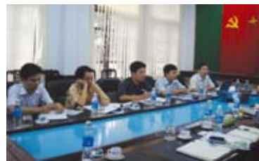
Discussions on the pilot project