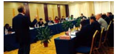
Working group discussion

The CLI was hosted by China in Guilin from November 17 to 20, 2009 as part of its support to the United Nations Forum on Forests (UNFF). In line with its nature of complementing UNFF in terms of promoting the global forest objectives which are contained in the non-legally binding instrument on all types of forests (NLBI), APFNet provided financial and technical assistance to the meeting, including development of the agenda and expected outcomes, identification of resource persons, and logistical arrangements. The theme of the workshop was "Forests for people – the role of national forest programs (NFPs) and the non-legally binding instrument on all types of forests". It brought together about 150 participants from 41 governments and 21 organizations. They shared experiences and lessons learned in the use of NFPs to achieve sustainable forest management and as a means to implement the NLBI.