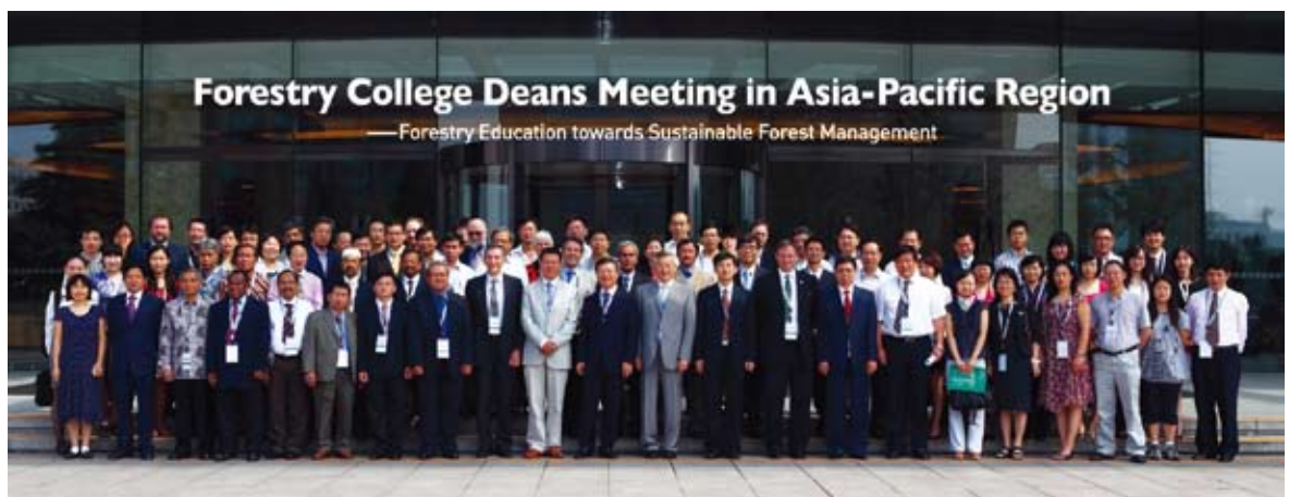
Group photo of participants

curricula and reached agreement to explore the feasibility of establishing a regional mechanism to address issues on an ongoing basis.