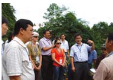
The participants communicating with local foresters