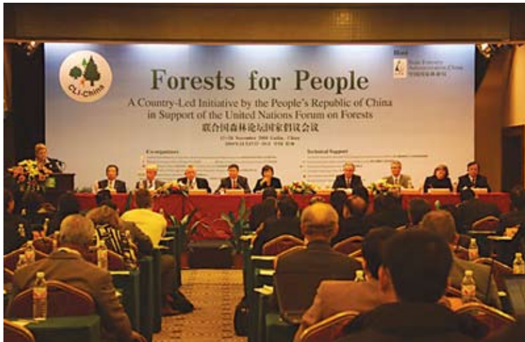
The plenary session of CLI-China