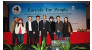
APFNet team provided support to CLI-China

The CLI was hosted by China in Guilin from November 17 to 20, 2009 as part of its support to the United Nations Forum on Forests (UNFF). In line with its nature of complementing UNFF in terms of promoting the global forest objectives which are contained in the non-legally binding instrument on all types of forests (NLBI), APFNet provided financial and technical assistance to the meeting, including development of the agenda and expected outcomes, identification of resource persons, and logistical arrangements. The theme of the workshop was "Forests for people – the role of national forest programs (NFPs) and the non-legally binding instrument on all types of forests". It brought together about 150 participants from 41 governments and 21 organizations. They shared experiences and lessons learned in the use of NFPs to achieve sustainable forest management and as a means to implement the NLBI.