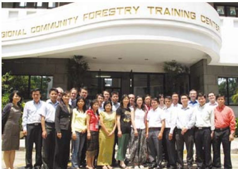
Group photo of participants in the workshop

APFNet and FAO jointly launched a one-year project entitled "Making forestry work for the poor: adapting forest policies to poverty alleviation strategies in Asia and the Pacific" in February 2010. It focuses on assisting forestry agencies to conduct strategic planning and to reduce poverty through sustainable forest management and rehabilitation.