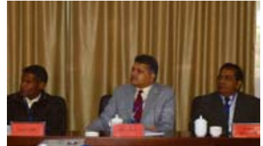
Participants listening to the presentation

This training workshop brought together policy makers and resource managers in the forest sector in the Asia-Pacific region to share information and expertise on sustainable forest management. Focusing on China's experience in forest resource management, the workshop informed participants of the latest developments in China's forest sector. Through the discussions, participants also identified priority areas and actual needs for future capacity building.